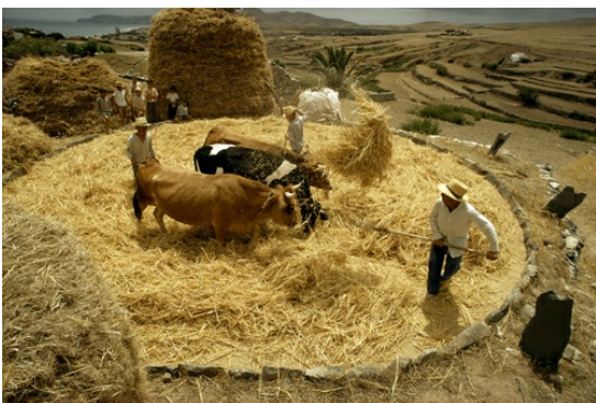
Team of Yoked Oxen Threshing Grain

Judges 20:6 "And I took hold of my concubine and cut her in pieces and sent her throughout the land of Israel's inheritance ; for they have committed a lewd and disgraceful act in Israel.